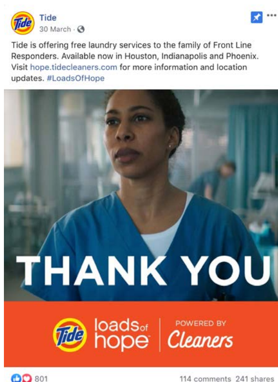
1 – “Thank You. Loads of Hope. Tide.” Screenshot of Tide detergent, Facebook post, 30 March 2020