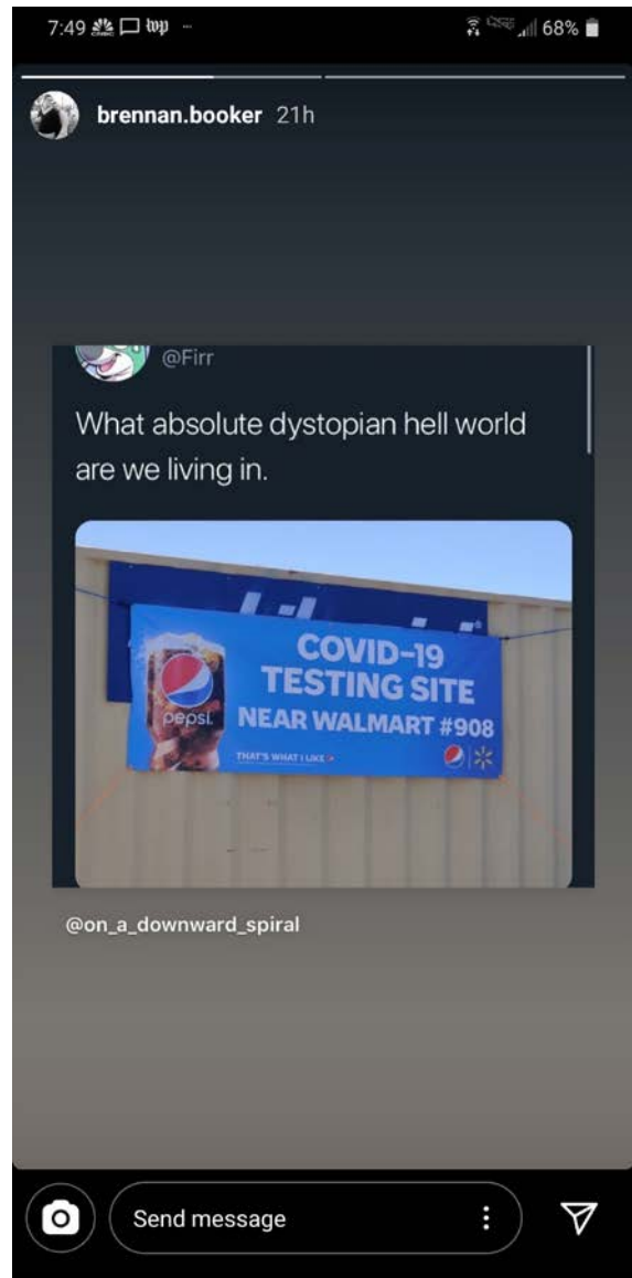
4 – “What absolute dystopian hell world we are living in.” Screenshot of Instagram post by photographer Brennan Booker, May 2020