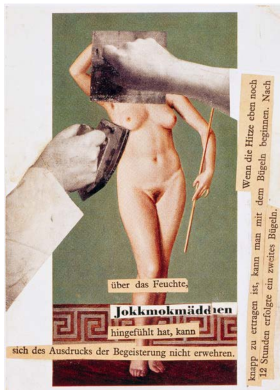
2 – Willi Baumeister, Jokkmokmädchen , 1941, collage on a postcard of Adolf Ziegler, Terpsichore , 1937, 14.9 x 10.5 cm, Willi Baumeister Stiftung.