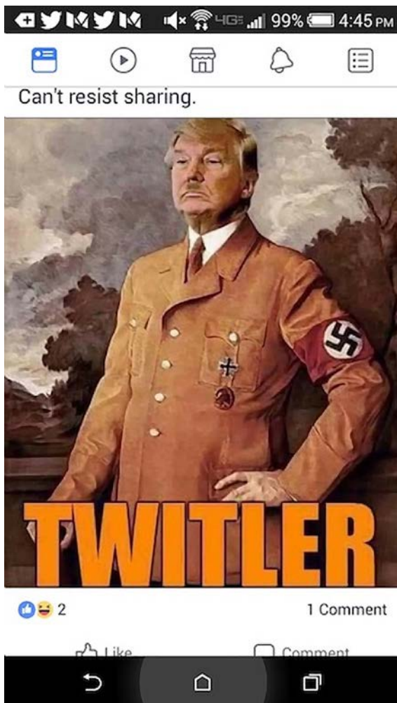
3 – “Twitter,” Facebook screenshot, 7 September 2017