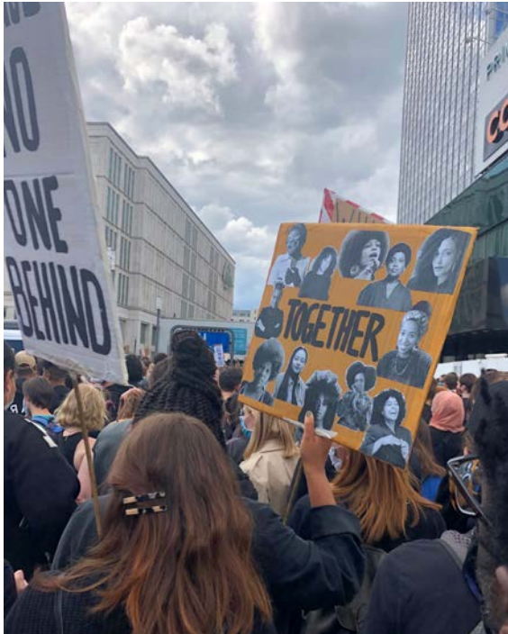
1 – Protest banner, “Silent Demo” against racism, 6 June 2020, Alexanderplatz, Berlin.