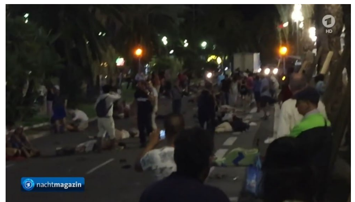
2 – Nachtmagazin , ARD, broadcast during the night from 14–15 July 2016, screenshot [original link no longer valid]